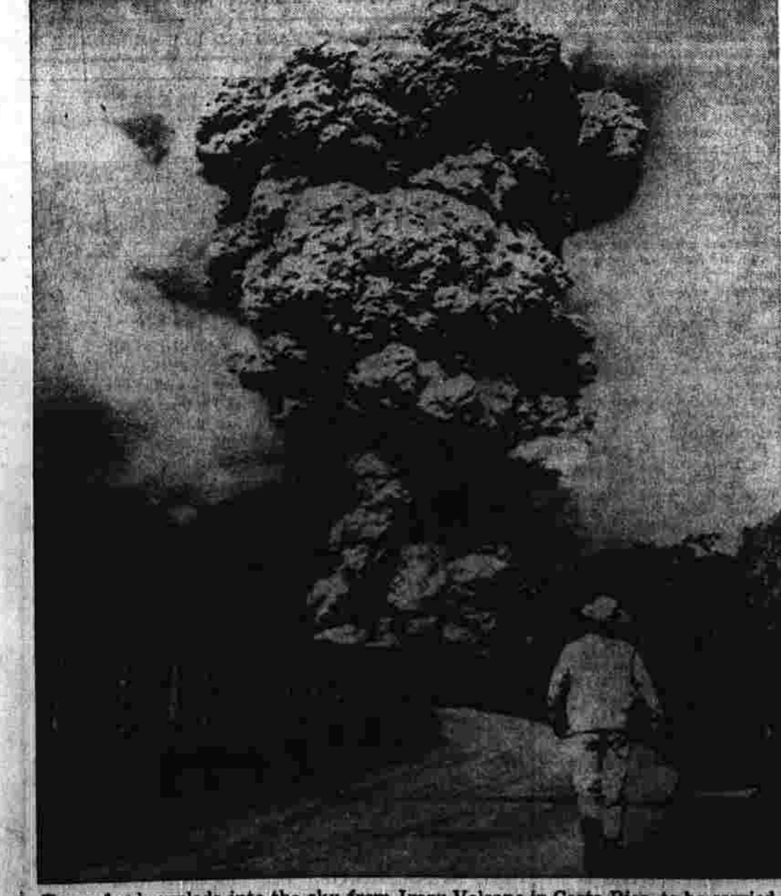
Tons of ash explode into the sky from Irazu Volcano in Costa Rica, to be carried by prevailing winds over the capital city of San Jose and the nation's once verdant Central Valley. Nation's economic life is threatened.