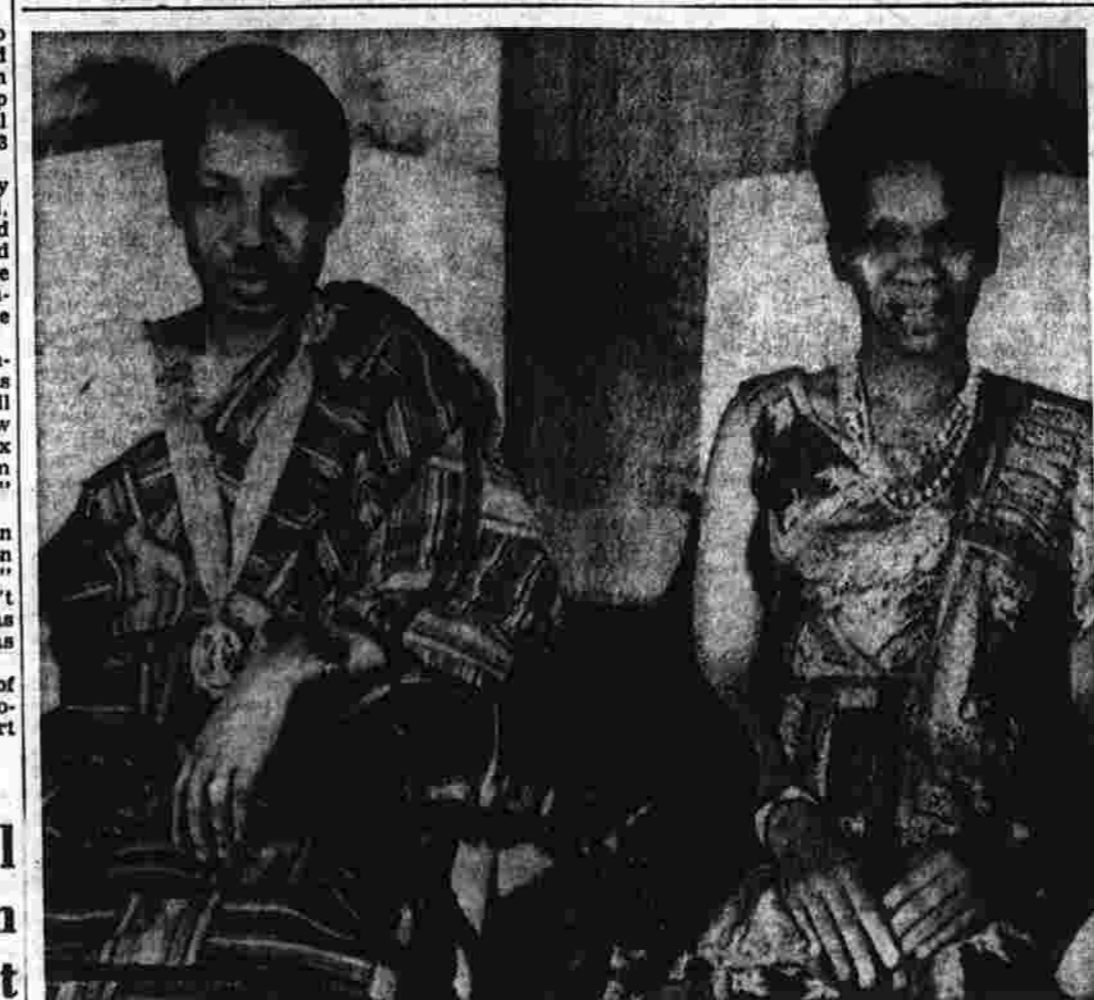
President Julius Nyerere of Tanganyika and his wife pictured in national dress in January 1963, shortly before Nyerere took office.